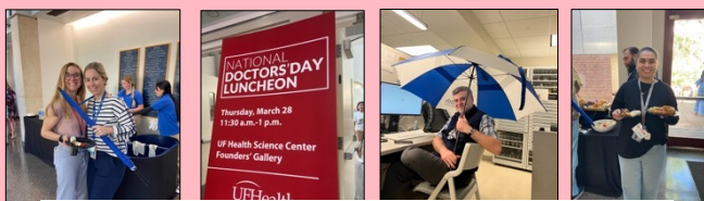
National Doctor's Day luncheon: free food.. and umbrellas!