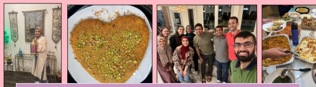
Ramadan Mubarak! Residents enjoy an iftar meal