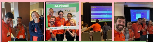
ACP Florida Doctor's Dilemma champions!

Meet our golden group of future interns 😊