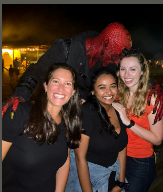
Real life spooks at the Haunted Corn Maze!