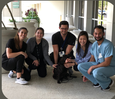
A very special furry guest