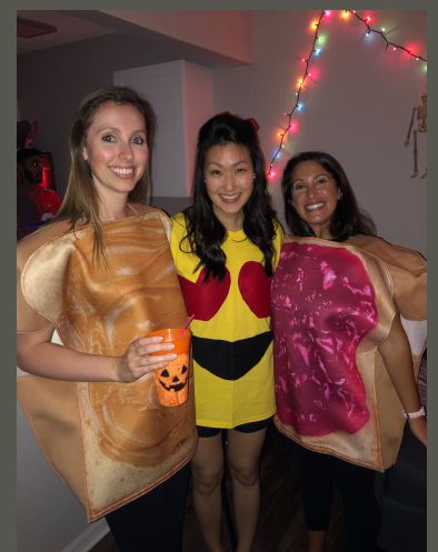
These costumes are fa-boo-lous