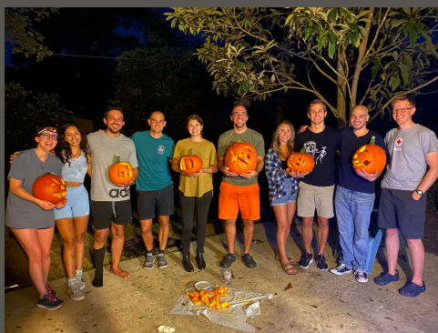
Exemplifying the "art" in art of medicine #SquashGoals