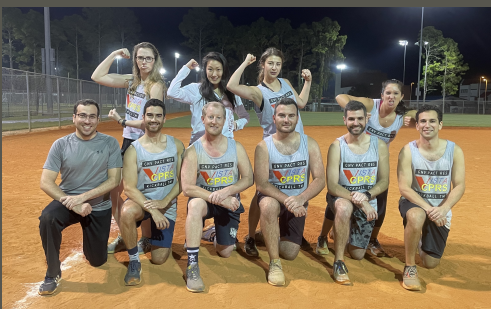
GNV PACT Res--the kickball team that is faster than CPRS on a good day

You know what they say--PGY-ghouls just want to have fun