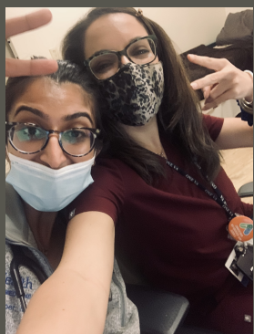
These PGY-Boos crushing VA nights