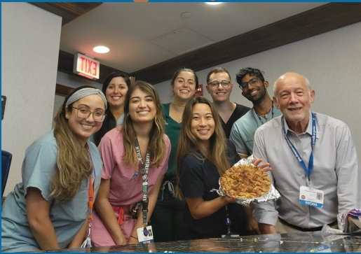
Gold Med with some beautifully crafted birthday apple pie