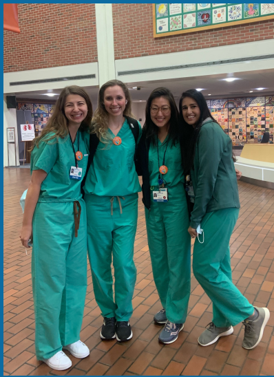
These PGY-3's looking absolutely fabulous in their seafoam green scrub attire