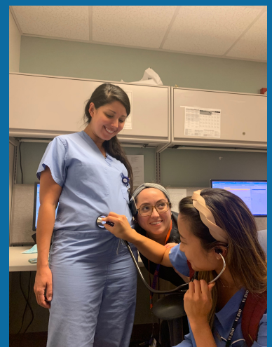
Giving the unofficial fourth gold medicine intern some attention