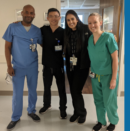
We love to see more of that