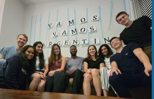
¡Vamos Argentina! Our PGY-1s gathered to watch the Copa America