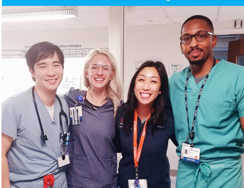
MICU Blue July A!