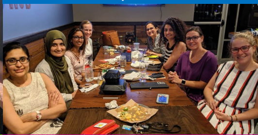
June FRIM Meeting!