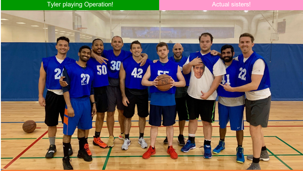
UF IM Basketball!!